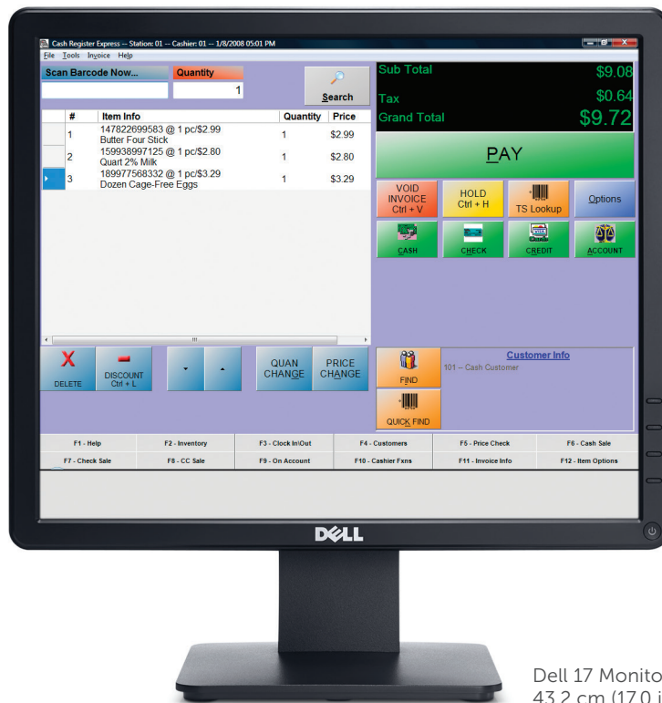
Dell 17 Monitor | E1715S 43.2 cm (17.0 inches)