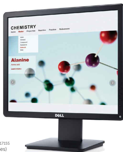
Dell 17 Monitor | E1715S 43.2 cm (17.0 inches)